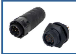
EN3® / EN2

Medical, food service, transportation, GPS, marine and general industrial electronic applications