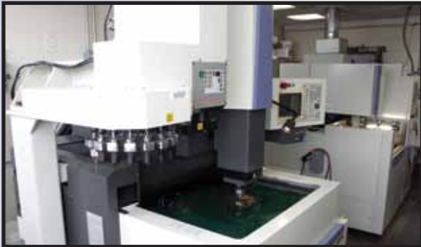
On Site Tool Room- EDM